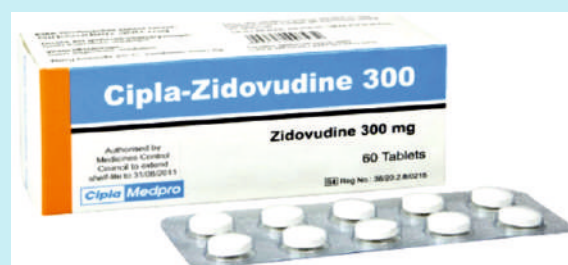
Zidovudine by M/s Cipla Ltd.