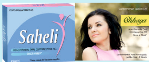
Ormeloxifene or Centchroman contraceptive pill developed by CSIR-CDRI