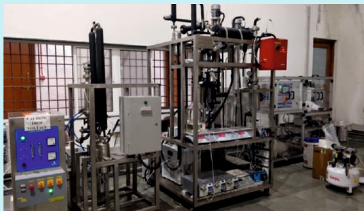
b) Azelaic acid Pilot plant

CSIR contributed significantly to the fight against COVID-19 across five verticals i.e. surveillance; diagnostics; drugs & vaccines; hospital assistive devices; and supply chain. Some of its notable contributions that aided in managing the pandemic under the drugs and vaccines vertical are listed below: