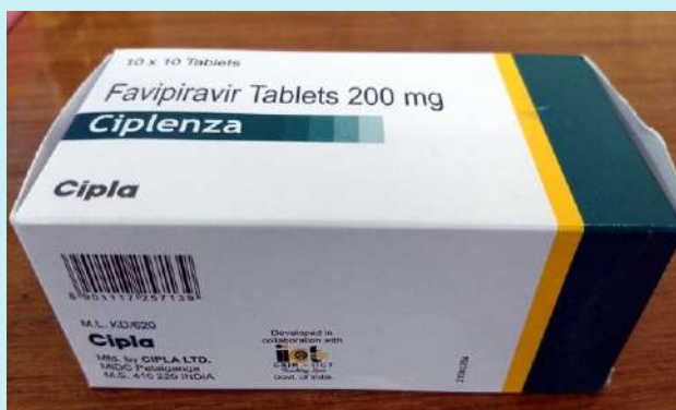
a) Ciplenza (Favipiravir) by M/s Cipla Ltd;

(Contd. from Page 10 - Special Feature.....)