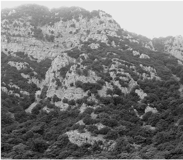
Fig. 2. Hyrcanian forest in the region of Golzar (trees up to 25 m high)