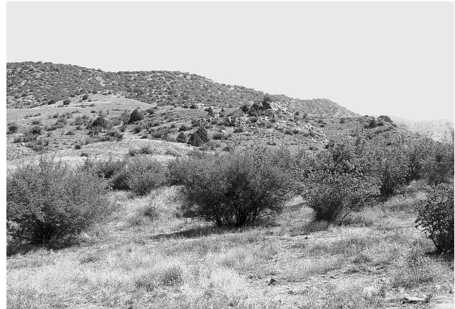
Fig. 3. View of Sharleg valley, showing a mixed vegetation of grasslands and shrubs up to 3 or 5 m tall, characteristic of the intermediate moisture region